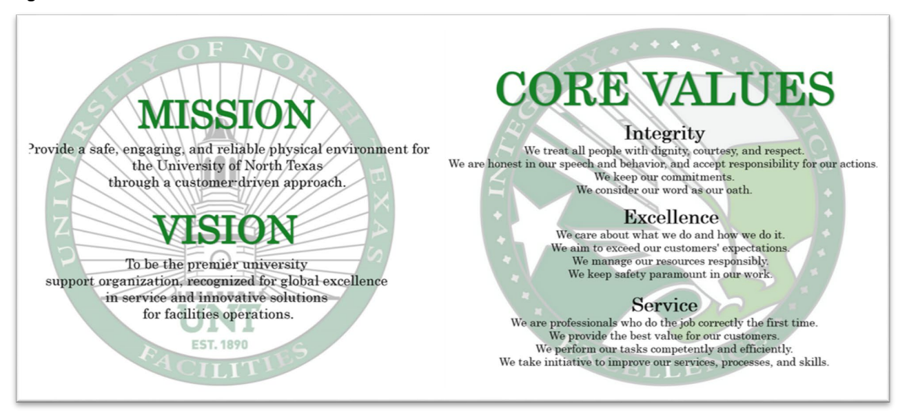
Fig.7 – Facilities Mission Statement and Core Values

The Outstanding Building Representative Award recipients are announced during the Town Hall in December. This award recognizes superior dedication, partnership, and stewardship towards the care and operations of the UNT campus.