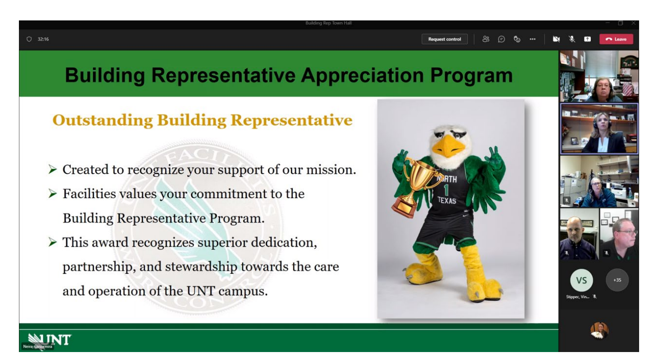
Fig.6 - Online Building Rep Town Hall. December 2021.

One of the responsibilities of the Building Representative is to attend to the quarterly Town Halls. These meeting are created to communicate with all the Building Representatives, have a closer interaction with our customers, and share other information that may be helpful to your role such as maintenance and construction project updates. It is also an opportunity to meet building representatives from other buildings. During the Town Halls, you have the chance to meet with Facilities employees, ask questions, and share any concerns you may have.